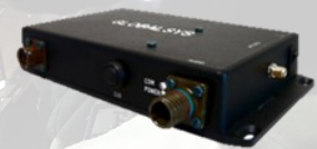
Fixed on-Aircraft Base Unit