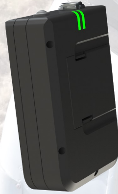
Adaptable Base Unit